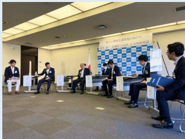
Photo: During the roundtable discussion

The Financial Services Agency (FSA) feels that the discussion was very fruitful as participants brought up specific points and suggestions from their positions.