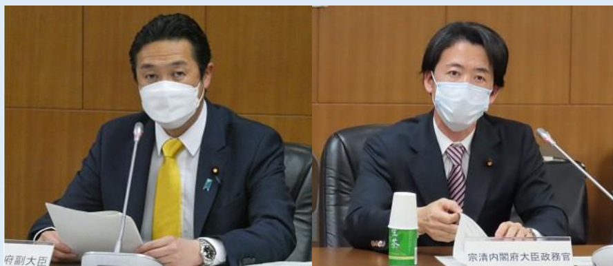
( Photo: State Minister KIKAWADA and Parliamentary Vice-Minister MUNEKIYO give remarks during the meeting with Directors-General of Local Finance Bureaus. )

During the meeting with local financial bureau chiefs, the Commissioner and other senior officials of the FSA explained current challenges to its financial policy and measures it has taken to address them, among others, in addition to remarks by State Minister KIKAWADA and Vice-Minister MUNEKIYO. FSA officials and local finance bureau chiefs shared the recognition of the challenges and other issues and confirmed that the FSA and the Local Finance Bureaus will continue to jointly cope with them.