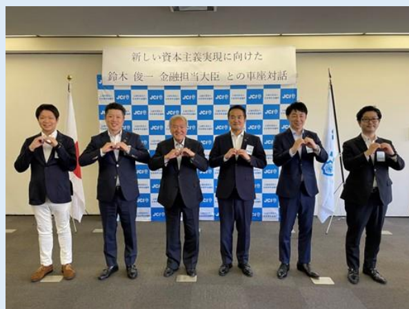
Photo: Participants Note: Participants form a shape of the Japanese kanji character for "eight" with two hands, which means "good in all directions."

Taking them into account, the FSA will further promote regional financial institutions' efforts to help local business operators address social problems.