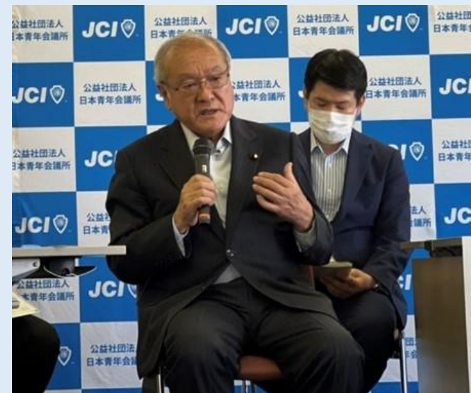
Photo: Minister SUZUKI during the roundtable discussion.

The theme of the roundtable discussion was "Regional financial institutions' escort-type support to foster social mind“, and business operators from across Japan attended it.