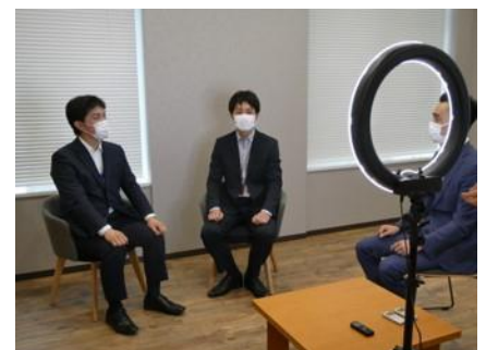
Interview using a ring light

We will continue carrying interview articles like the ones in this issue.