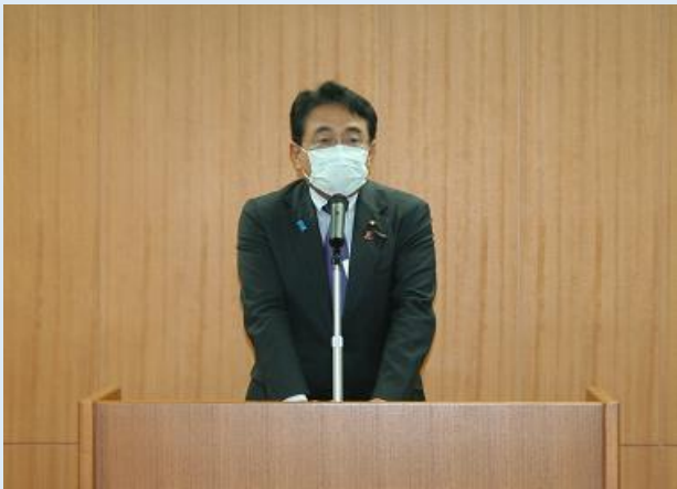
Photo: State Minister Akazawa delivering a speech