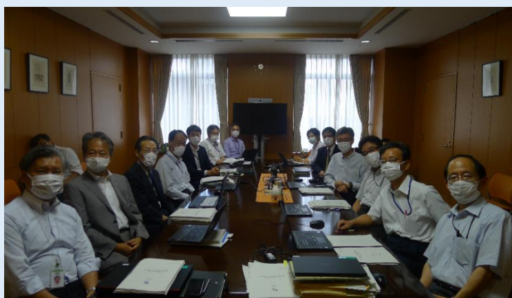
[ Editorial meeting ]

As measures against COVID-19, the first pillar, JFSA has encouraged private financial institutions to provide loans with no interest and no collateral in effect and has endeavored to strengthen cooperation between government-affiliated