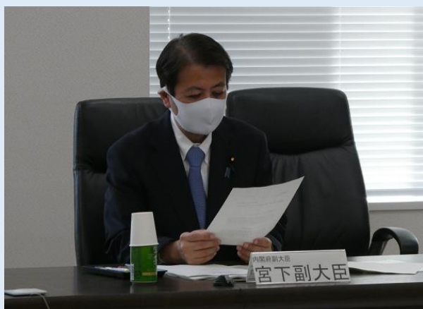
Photo: State Minister Miyashita (then) reading out the consultation document

On September 11, the 44th General Meeting of Financial System Council was held. At the meeting, State Minister Miyashita (then) delivered an opening speech and a consultation was conducted for the first time in nearly three years.