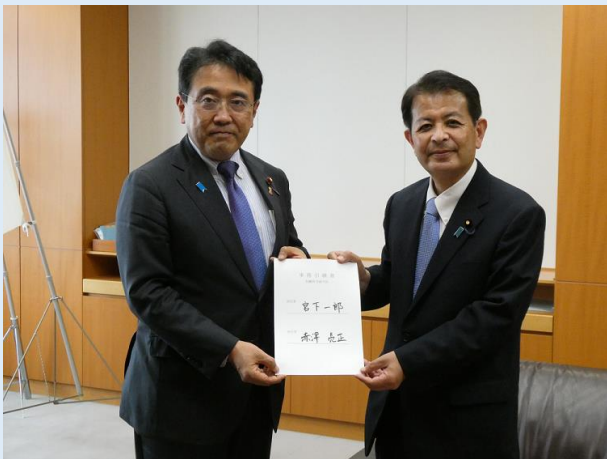
Photo: State Minister Akazawa (left) and former State Minister Miyashita (right)